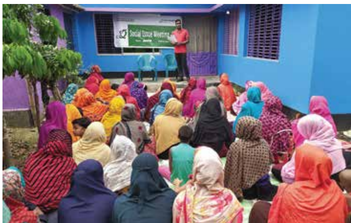
Social issue-based meeting organized by Meherpur CDP, Mar/2021