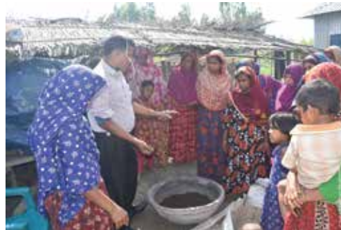
Training on income generating activities, Mar/2021

Seasonal Livelihood Program (SLP) is the main economic resilience option for the climate-affected beneficiaries in Jatrapur Union, Sadar Kurigram, under the project