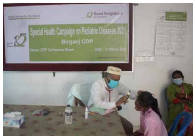
Special Health Campaign on Pediatric Disease by Birganj CDP, Mar/2021