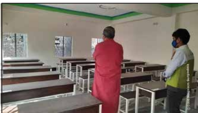
SMC chairperson of Sultan Mollah Adarsha High school visited the school during furniture installation, Mar/2021