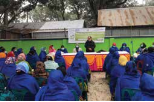
Monthly review meeting with CHW & CHW Supervisors at Nafanagar & Ishania Union, Jan/2021