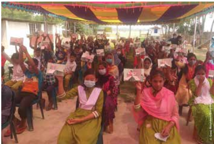
Solar Lantern distribution program among 3,000 students by Moulvibazar CDP, Mar/2021

We wish the woman under Dewlabari and Songgrampur Union will get the opportunity for their development economically and socially, through Good Neighbors Porabari Mohila Somobay Somity Ltd.