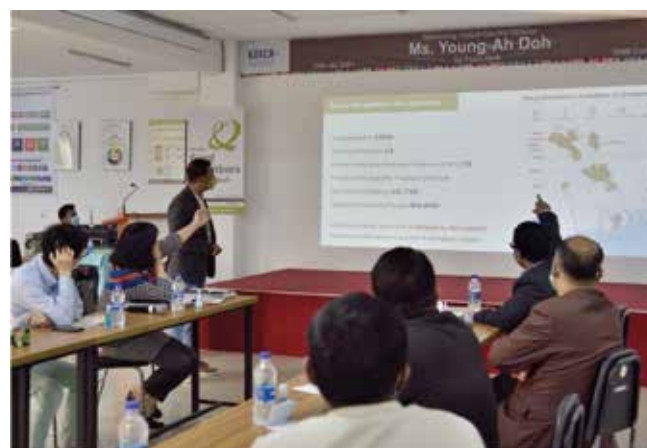
Special visit by KOICA Bangladesh office, Jan/2021