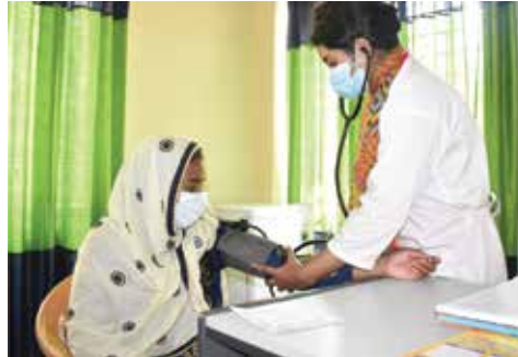
ANC check up to pregnant women in the Nafanagar union 24/7 SDC, Mar/2021