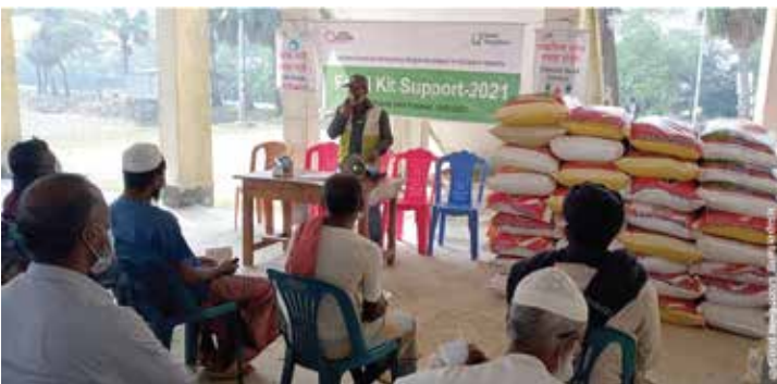
Food kit distribution among 6,990 families, Feb/2021