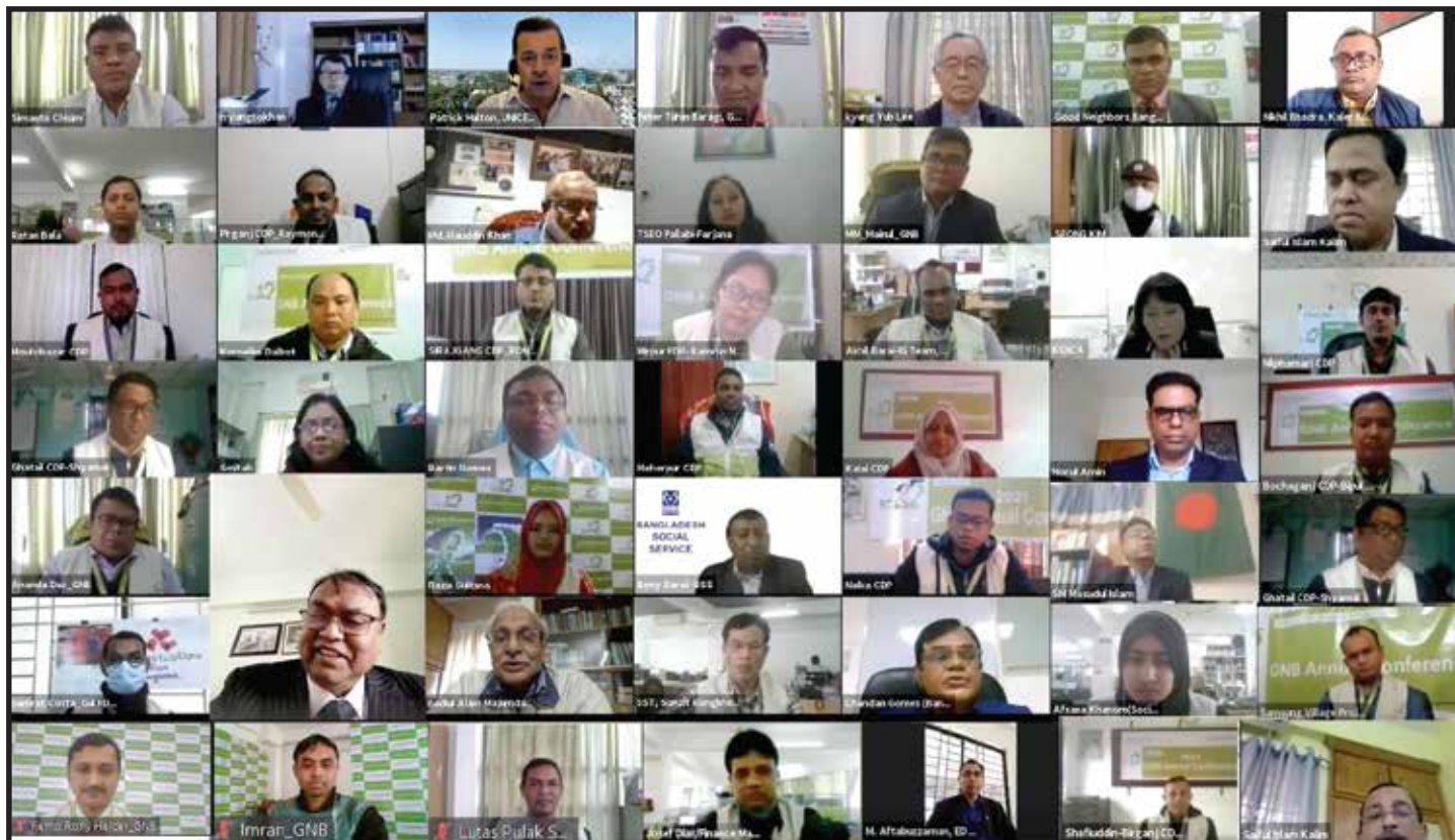
2021 GNB Annual Conference, Jan/2021

Good Neighbors Bangladesh has been working for 25 years with transparency and accountability in building humanity and society. GNB has shown the ability to stand by the people and deal with them with courage in the epidemic of COVID-19. Representatives of various donor agencies appreciated the work of GNB and expressed the hope that this relationship would continue in the future.