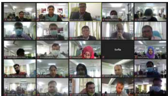
Team Building Workshop, Jan/2021