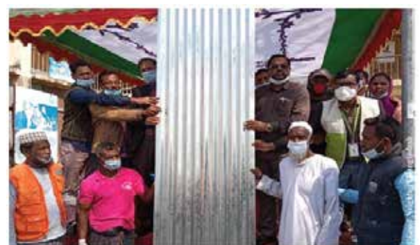
House materials distributed by GNB among 1100 Cyclone Amphan Affected People, Feb/2021