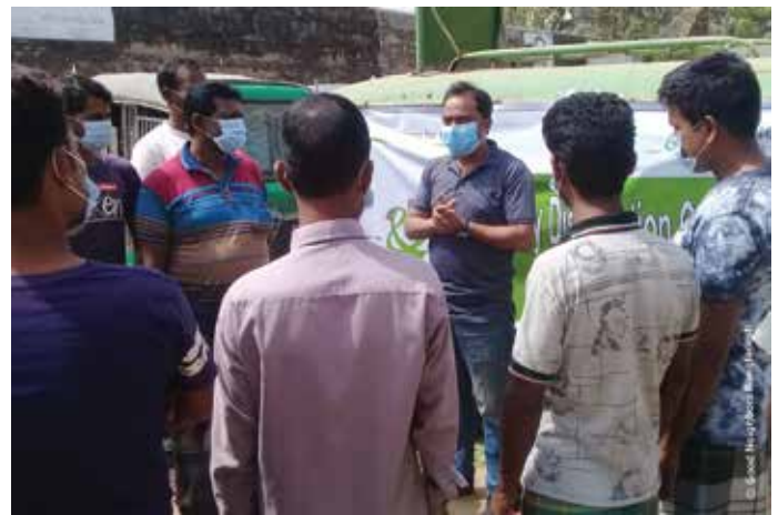
Raising awareness on coronavirus by Shakhipur CDP, Mar/2021