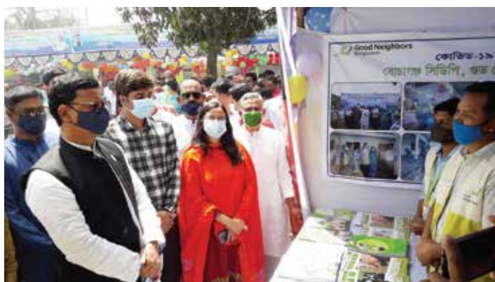
Bochaganj CDP has participated in development fair organized by Bochaganj Upazila. UNO and state minister of shipping visiting the stall, Mar/2021