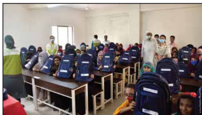
Education materials distribution program at Sultan Mollah Ideal High School, Mirpur, Mar/2021