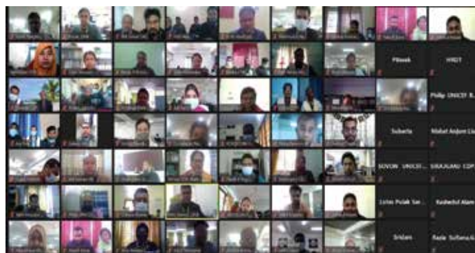
Training on Basic Managerial Skills, Jan/2021