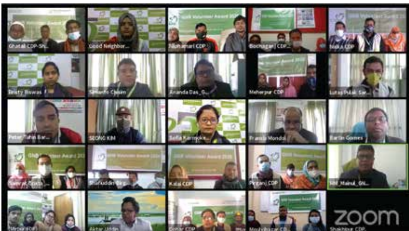
Recognition for Voluntary Service, GNB Voluntary Award 2020, Feb/2021

To promote volunteerism and to encourage youths to contribute to social activities GNB arranged 'GNB Voluntary Award 2020' for recognition of voluntary service. 14 volunteers have received this award from 14 CDPs.