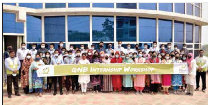
5th GNB Internship Workshop, Mar/2021