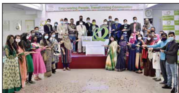
New Year Celebration and GNB Silver Jubilee Logo Inauguration, Jan/2021