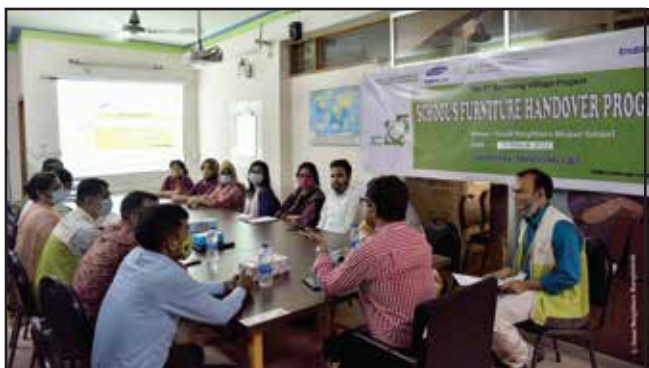
School furniture handover program, Mar/2021

GNB Samsung C&T Corporation Samsung Village Project has taken initiatives “to upgrade the school facility as Child-Friendly School by providing related equipment’s” in this regard GNB Samsung Village Project has arranged a handover program in Good Neighbors Mirpur School.