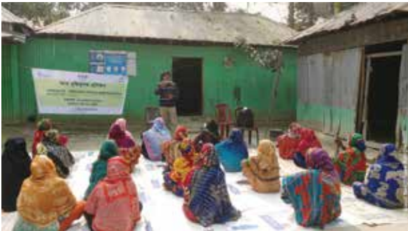
Training on income generating activity, Feb/2021