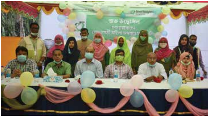
School furniture handover program, Mar/2021

Recently we have opened a new CBO, and it's our 15th Cooperative in Ghatail, Tangail named Good Neighbors Porabari Mohila Somobay Somity Ltd.