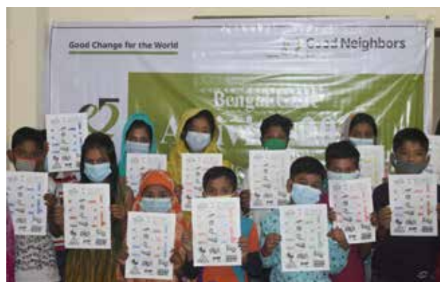
Students with the sheets of Bengal cube, Feb/2021