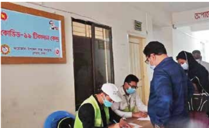
Provided voluntary service to the Upazila health complex for vaccination on COVID-19 by Dohar CDP, Mar/2021