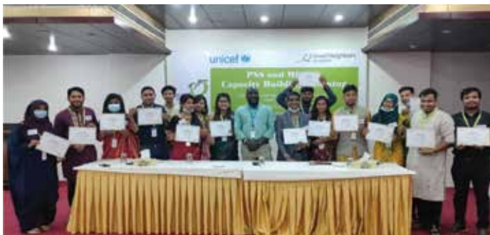
Structural Psychosocial Support Training by UNICEF, Mar/2021