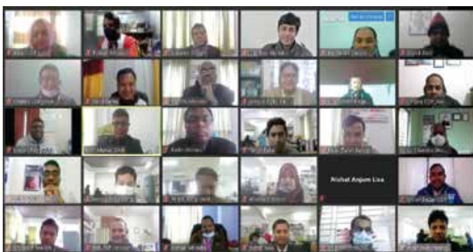
Review Workshop on Agile Communication, Jan/2021