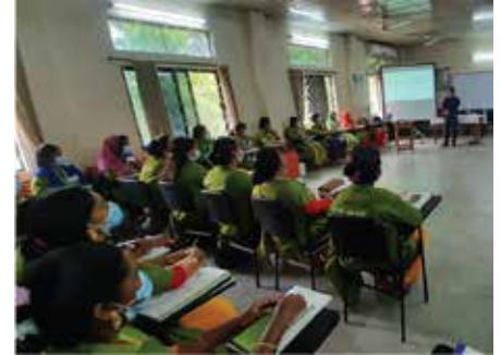
CHW are having training session on "Mobilization & Volunteerism", Mar/2021