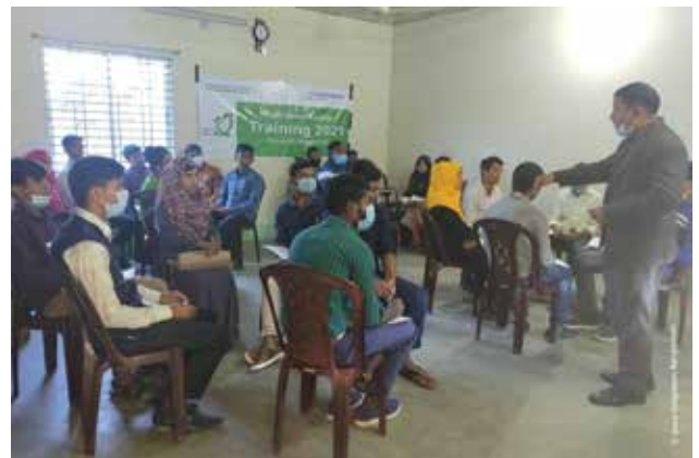
Training for Dream School teachers for effectively class operating by Nilphamari CDP, Feb/2021