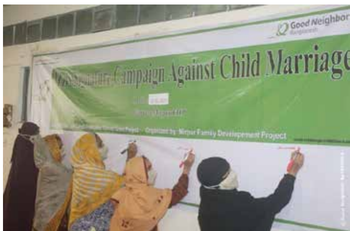
Mass signature campaign against child marriage by Mirpur CDP, Feb/2021