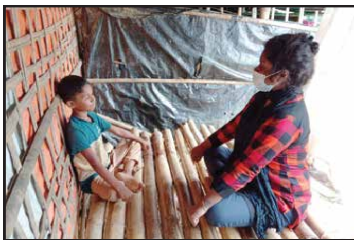
Mental Health and Psychosocial Services support delivered to a child in Camp 15 by RER project staff, Sep/2020