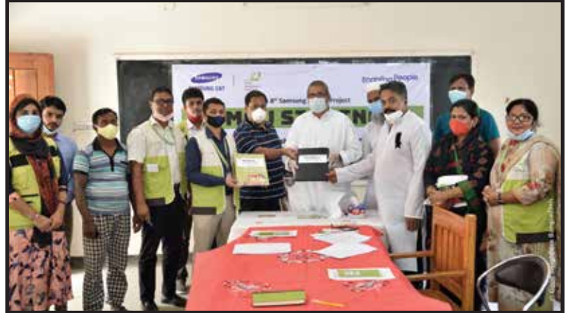
MoU Signing at Sultan Mollah Adarsha High School for construction & Renovation work by GNB-SAMSUNG village project, Aug/2020

A Memorandum of Understanding (MoU) signing program held between GNB and Sultan Mollah Adarsha High School, Mirpur, Dhaka for implementing The 8th SAMSUNG Village Project . The project will work to improve the infrastructure and quality of education at Sultan Mollah Adarsha High School. Among these, we will construct the school building roof, will be provided chair-table bench & develop multimedia classroom, science lab, books & furniture for the school library, education materials for students, teaching materials for the teachers, etc. On behalf of Sultan Mollah Adarsha High School, Head Teacher, teachers & School Managing Committee members, and on behalf of GNB, Communication Team Manager, CDP Manager and the staff of Samsung Village Project were present.