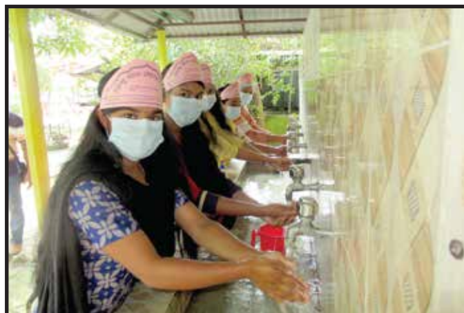
Celebrating Hand Washing Day by Meherpur CDP, Oct/2020