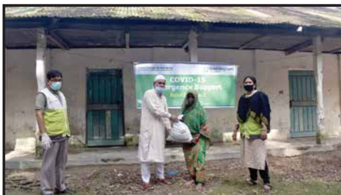
Emergency food distribution, Jul/2020

WFP-GNB Building Resilience to Achieve Zero Hunger (BRAZH) project, Kurigram had performed 18 sessions with Ward Disaster Management Committee (WDMC) members in project intervention areas the Jattrapur and Begumganj Unions and distributed emergency food support due to COVID-19 among 120 families prioritized from widow, disable, pregnant woman, aged people with chronic food security condition under 2 unions.