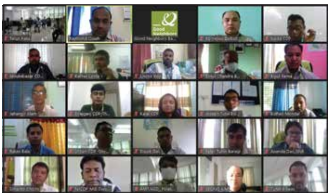
GN Child Protection Policy introducing Workshop, July/2020