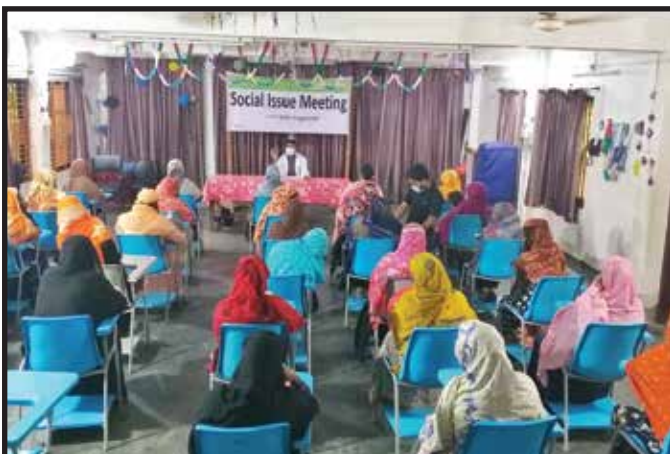
Social Issue meeting to create awareness on Rights of the Children and Women, Sep/2020