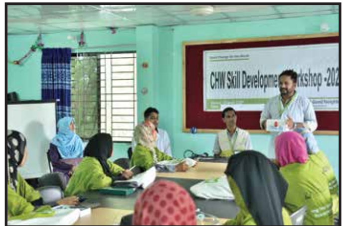
CHW Skill Development Workshop arranged by Ghatail CDP, Aug/2020