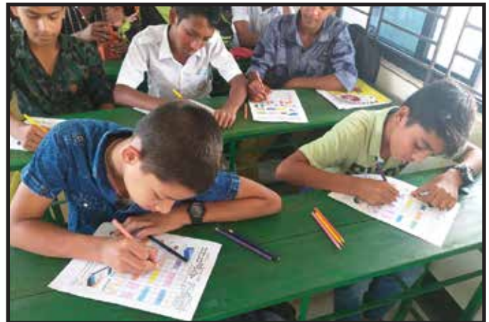
Children fulfilling Bangle Cube study sheet as Brain games at Moulvibazar CDP, Sep/2020