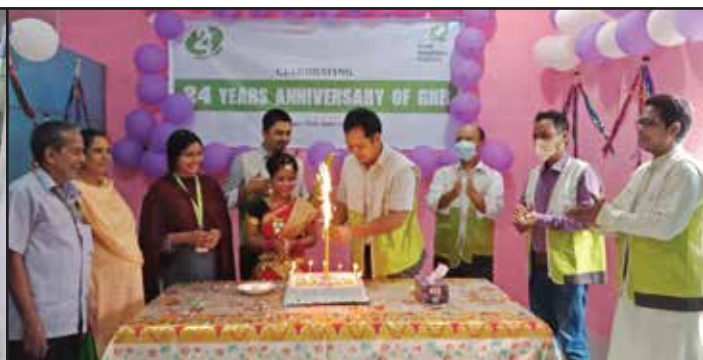
Celebrating 24th Anniversary of GNB, Aug/2020