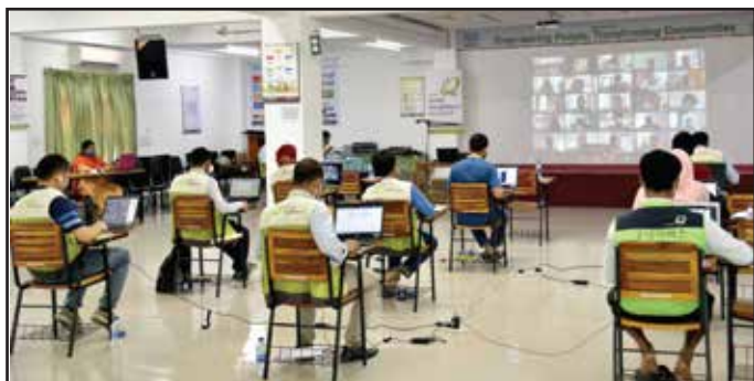
Halfyearly managerial workshop, July/2020