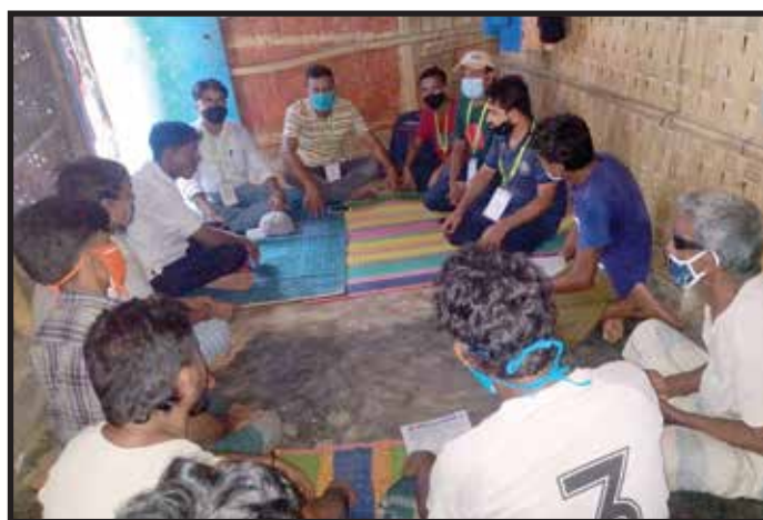
Conducted Positive Parenting awareness and general protection sessions, Sep/2020