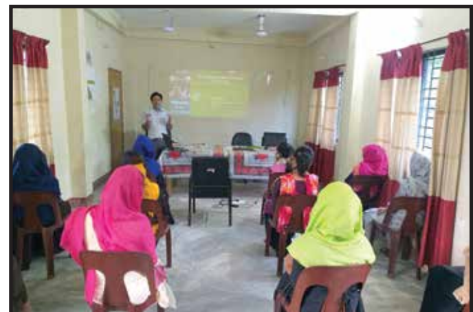
Youth Development training arranged by Moulvibazar CDP, Aug/2020