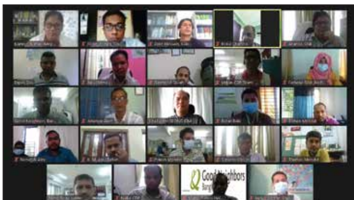
PSEA Training for ensure and establish PSEA, Sep/2020