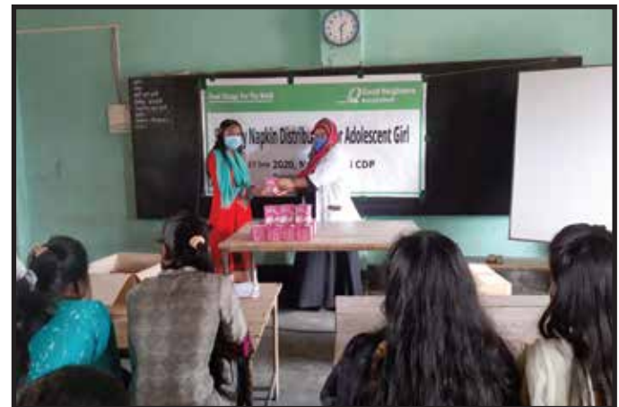
Sanitary Napkin Distribution among adolescent girls by Nilphamari CDP, Sep/2020