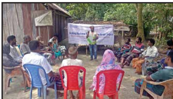
WDMC quarterly meeting, Aug/2020