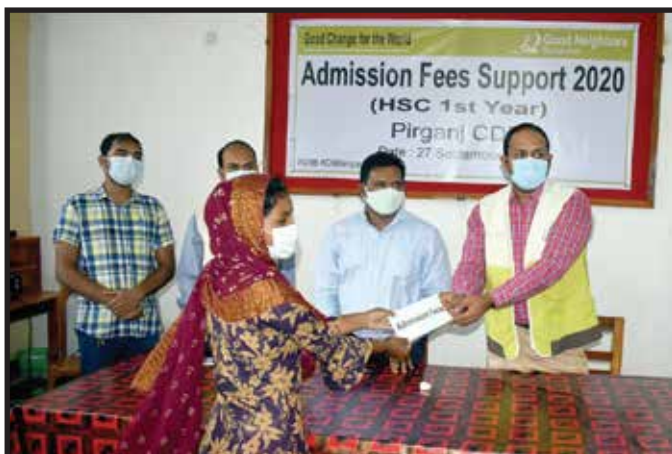
Admission fees distribution among 137 sponsored children by Pirganj CDP, Sep/2020