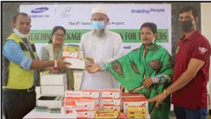
Teaching Materials distribution for Teachers, GNB-SAMSUNG village project, Sep/2020

To create a child-friendly learning environment and ensure quality education among 4 schools in Mirpur, Dhaka, GNB has provided Teaching Materials for Teachers funded by Samsung C&T Corporation under 'The 8th Samsung Village Project'. On behalf of the School, the Head Teacher & the member of SMC received the materials. After receiving they expressed their gratitude to the GNB as well as SAMSUNG C&T Corporation.