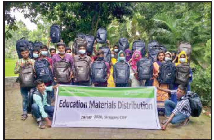
School bag distribution as education materials among Sponsored Children of Sirajganj CDP, Aug/2020