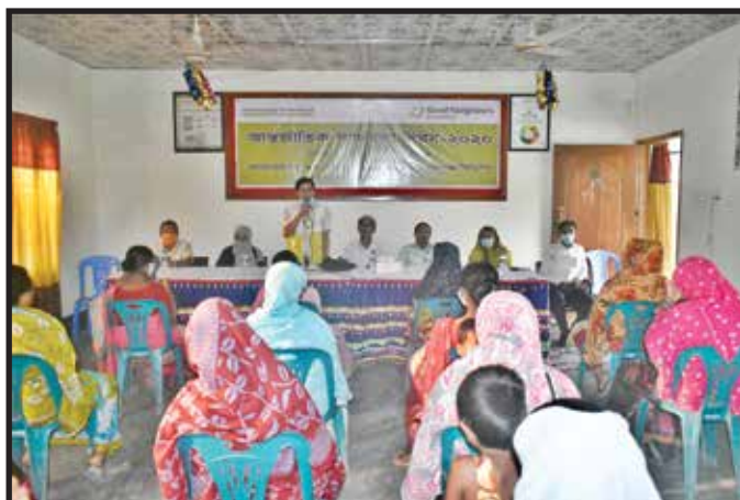
Celebrating International Literacy Day with 56 participants by Bochaganj CDP, Sep/2020