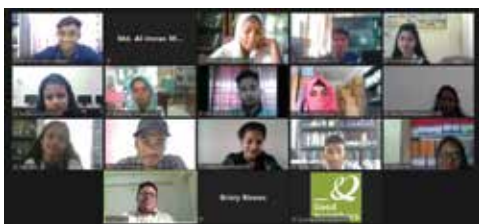
National Child Council Meeting, Aug/2020