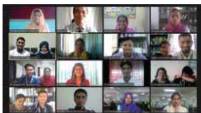
National Youth Council Meeting, Sep/2020