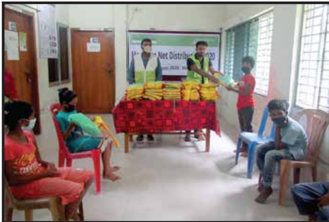
Mosquito Net distributed among 230 sponsored children by Meherpur CDP to prevent mosquito based disease, Aug/2020