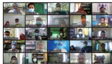
IG Staff capacity development workshop, Jul/2020