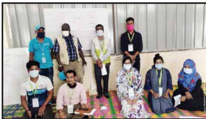
Group photo, Aug/2020

"UNICEF Field Observation" has been conducted at Camp-15 Block-E-9 Multi-Purpose Child and Adolescent Center [MPCAC] by the new Chief of field office along with Assistant Chief Focal Officer, PD Manager of UNICEF. The purposes of the field observation were to know the current status of the entire activity by GNB-UNICEF Rohingya Emergency Response (RER) Project.