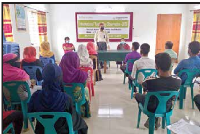
Celebrating International Youth Day by Kalai CDP, Aug/2020