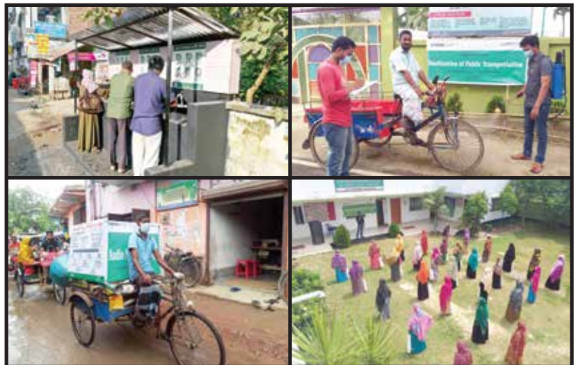
Activities under SEOUL City Project, Kalai CDP

To improve the status of community people in unexpected emergency crisis situation regarding COVID-19, GNB-SEOUL City Project, Kalai CDP conducted Audio Mass Campaign, installed a handwashing booth in the local market place, sprayed disinfectant in local vehicles, distributed hygiene kit, and raising awareness on COVID-19.