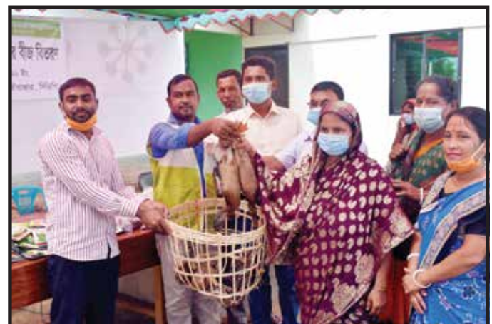
Seeds, Duck & Hen distributed among 130 families by Moulvibazar CDP, Sep/2020