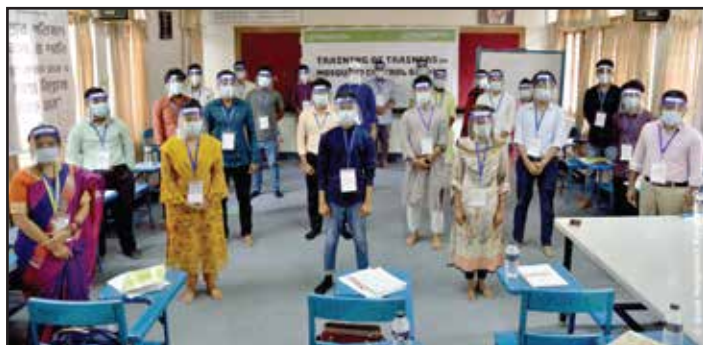
Training of Trainers on Mosquito Control Service, July/2020