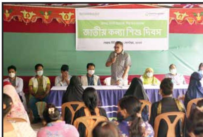
Celebrating National Girl Child Day by Dohar CDP, Sep/2020