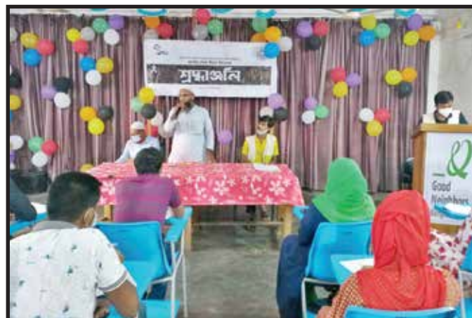
Celebrating National Mourning Day by Sirajganj CDP, Aug/2020