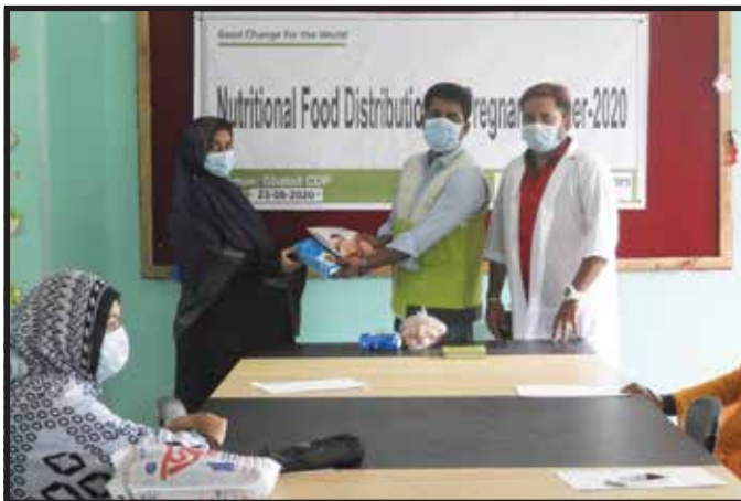
Nutritional food distribution among pregnant mothers of Ghatail CDP, Aug/2020