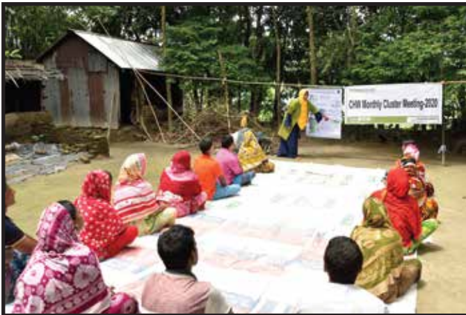
Monthly cluster meeting facilitated by CHW with pregnant mothers and guardian at Ghatail CDP, Sep/2020