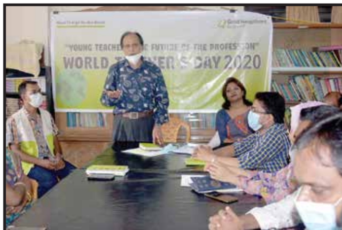
Celebrating World Teacher's Day by Gulshan CDP, Oct/2020