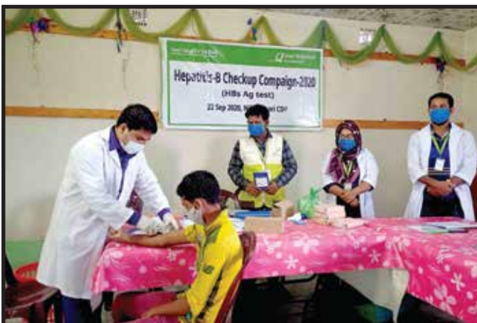
Hepatitis-B checkup Campaign by Nilphamari CDP, Sep/2020