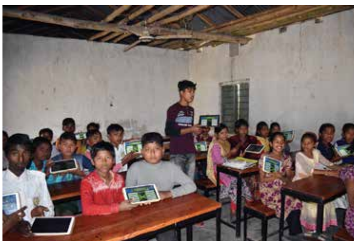
Birganj CDP/Feb 2020