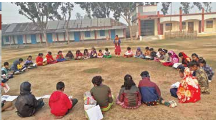
Birganj CDP/Feb 2020