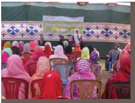
Meeting with the guardians of the Children Under Threat of Marriage (CUTOM)

We work through child councils, youth councils, community development committies, child rights keeper, and community health worker.