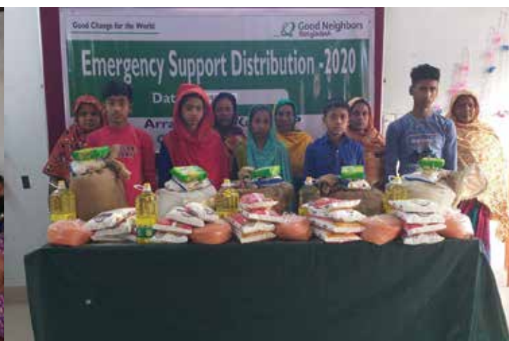
Kalai CDP/Feb 2020