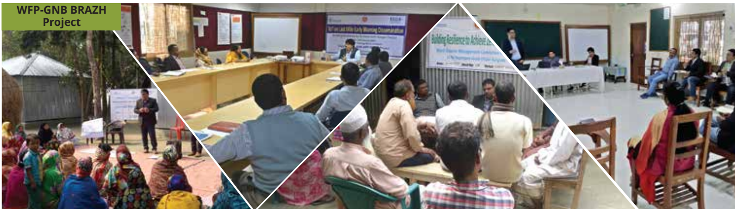
Some activities of our WFP Building Resilience to Achieve Zero Hunger (BRAZH) Project at Kurigram.