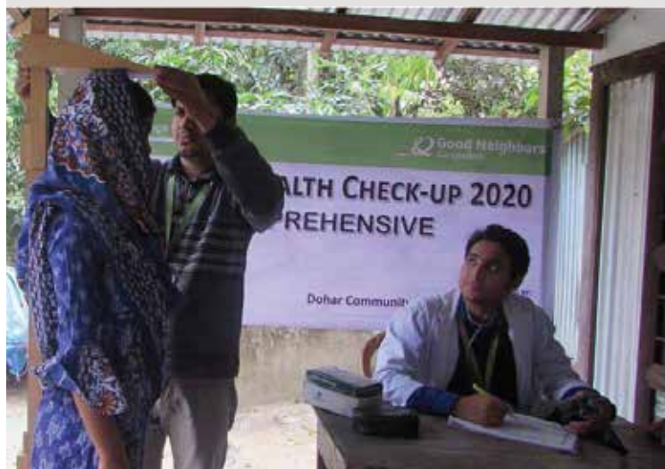
Photo: Standard Health Checkup, Dohar CDP