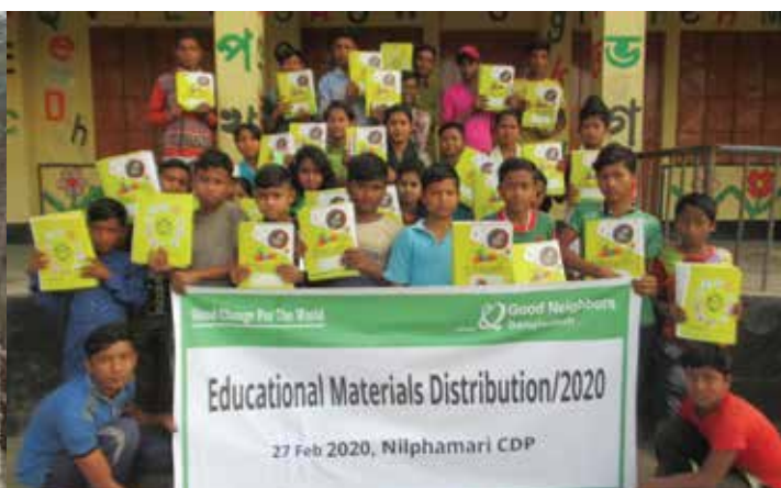
Nilphamari CDP/Feb 2020