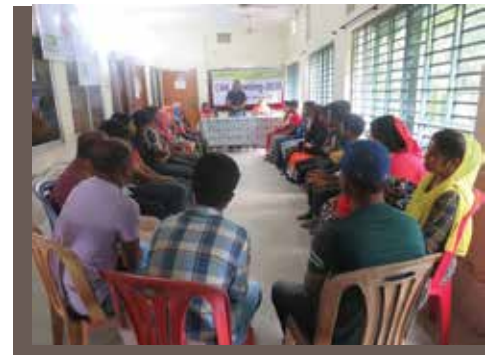
Meeting with the members of Child Rights Keeper (CRK)