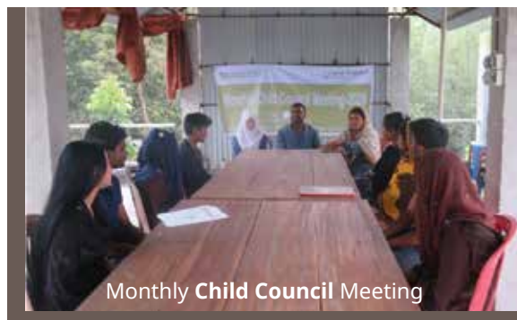
Monthly Child Council Meeting