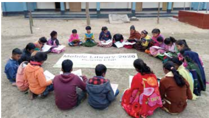
Pirganj CDP/Jan 2020