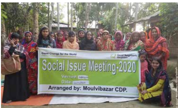
Moulvibazar CDP/Jan 2020