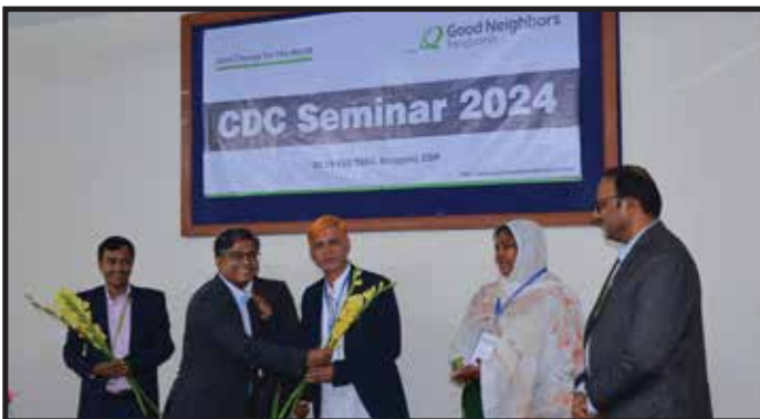
The Country Director is giving floral greetings to the newly elected committee chairperson and secretary