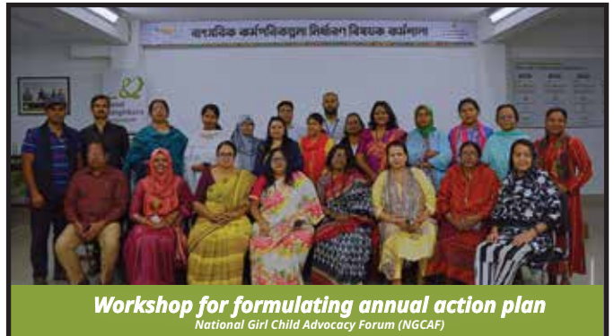
Workshop for formulating annual action plan National Girl Child Advocacy Forum (NGCAF)