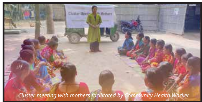
Cluster meeting with mothers facilitated by Community Health Worker