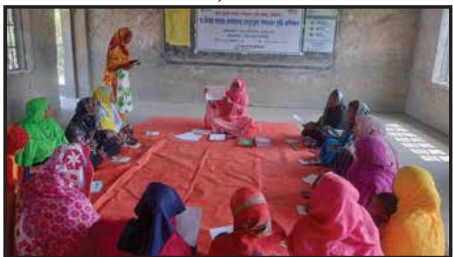
Leadership Training of Self Help Group Leaders