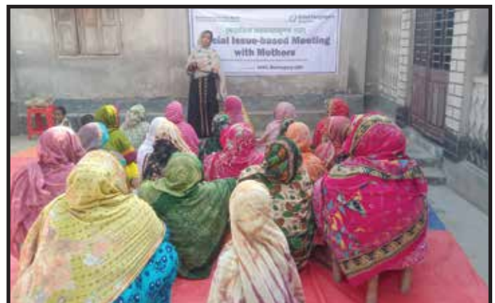
Social Issue-based meeting with Mothers, Bochaganj CDP, Mar/2024