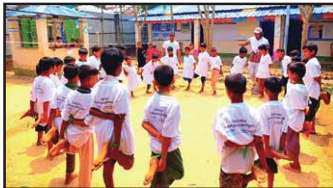
Psychosocial Support session