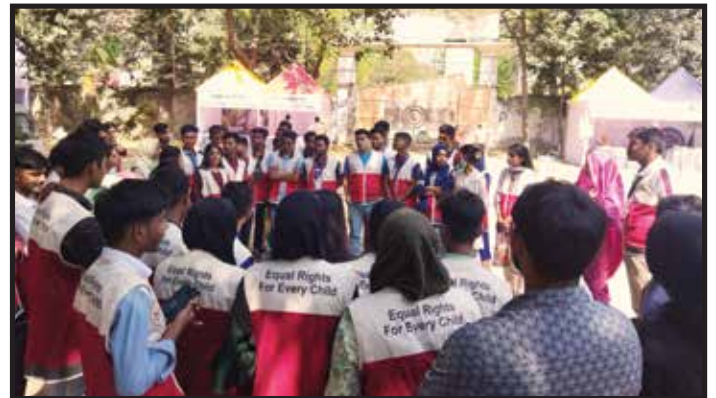
Volunteers are making their final preparation for maintaining security