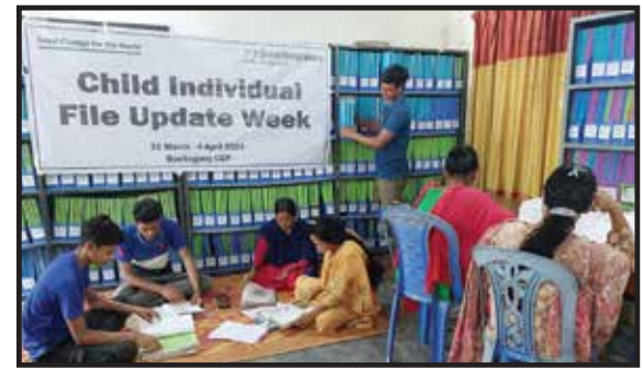
Sponsorship Service (SS) Supporters are working on updating Child Individual File