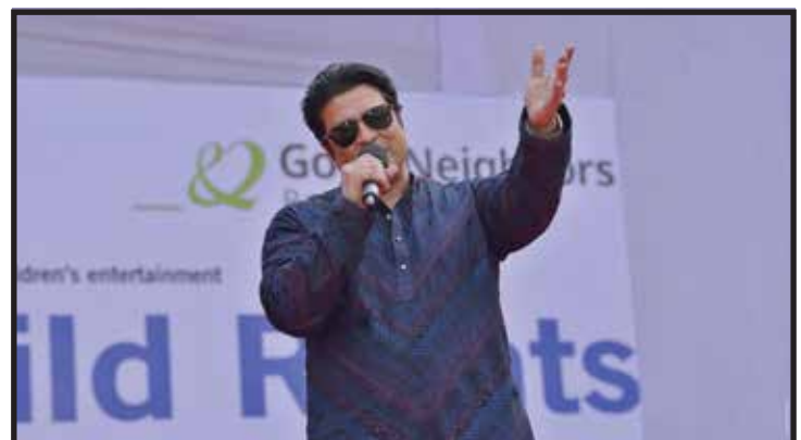
Hon'ble special guest delivering his speech

The country director of GNB presided over the whole event.