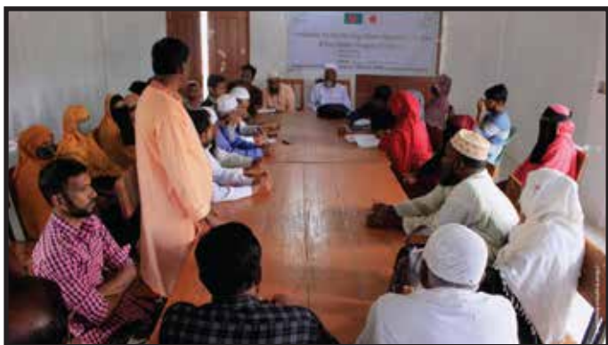
Coordination Meeting with Village Disaster Management Committee (VDMC) and Ward Disaster Management Committee (WDMC)