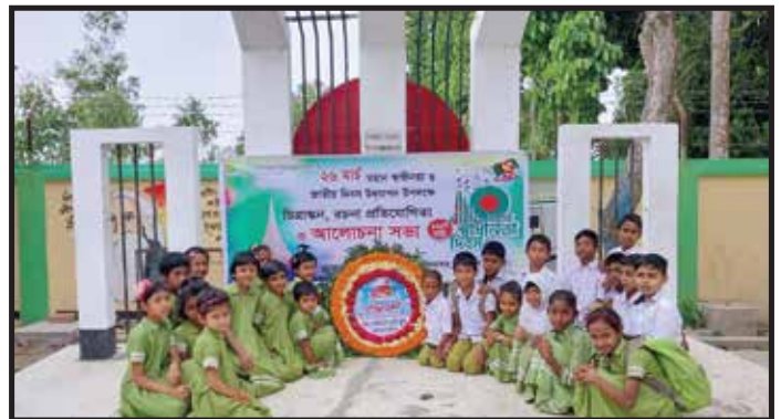
Celebrating Independence Day