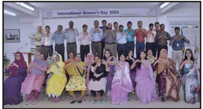
Celebrating International Women's Day