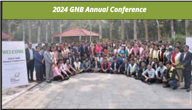
2024 GNB Annual Conference