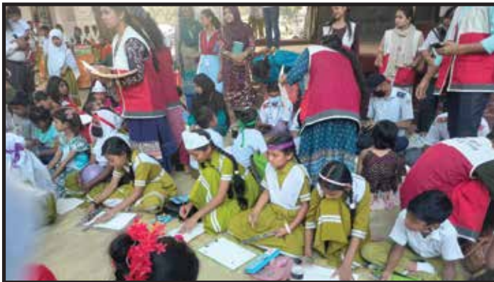
Children participated in the art competition