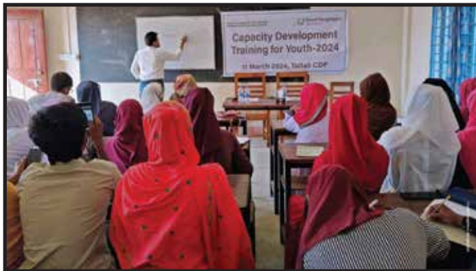
Capacity Development training for youth, Taltali CDP, Mar/2024