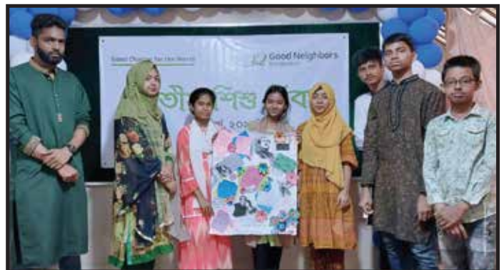
Celebrating National Children's Day