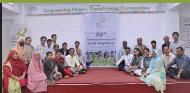
Empowering People, Transforming Communities 33rd Founding Anniversary of Good Neighbors