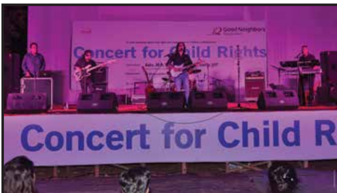
Eminent singer, music producer, and national award-winning composer Bappa Mazumder performing in the stage for the audience of the Concert for Child Rights