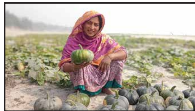
Sweet pumpkins harvesting on the barren sandbar