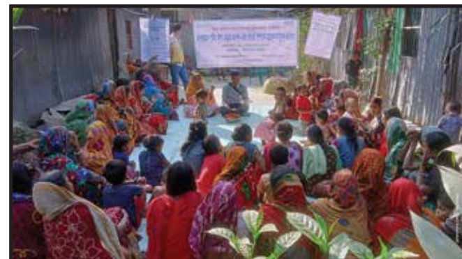
Campaign on mushroom nutrition & consumption and cooking demonstration