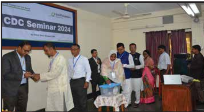
Participants are casting vote for 2024 GNB National CDC