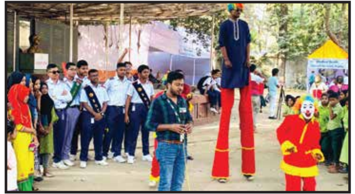
Children are enjoying the jokers show