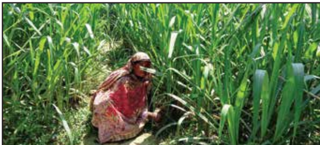
A beneficiary is cultivating sugarcane land