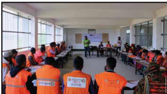
'Capacity Building Training' on DRR for Cyclone Preparedness Program (CPP) volunteers.