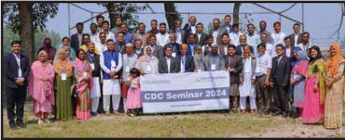
Group photo with the participants of CDC Seminar 2024

Good Neighbors Bangladesh (GNB) organized the Community Development Committee (CDC) Seminar 2024, bringing together chairpersons and vice-chairpersons from 17 CDCs under 17 CDPs, held on February 29, 2024, at Sirajganj CDP.