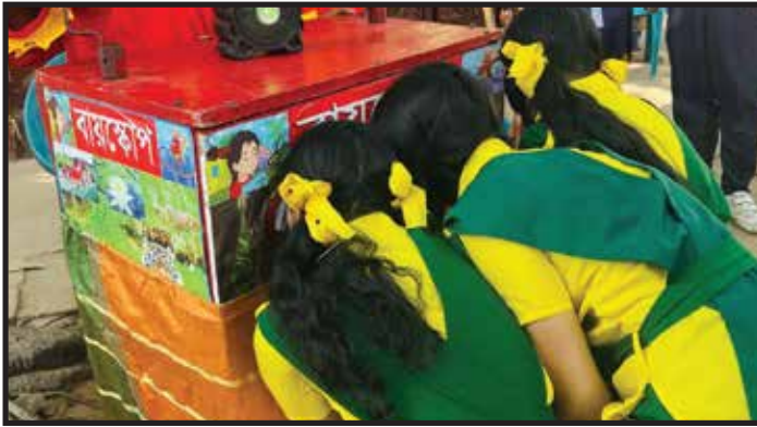
Children are enjoying the bioscope show