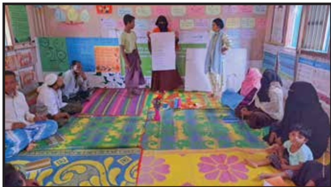
Conducted capacity-building training for the Community-based Child Protection Committee