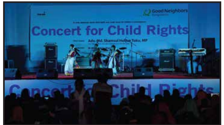
Children's performance in cultural competition