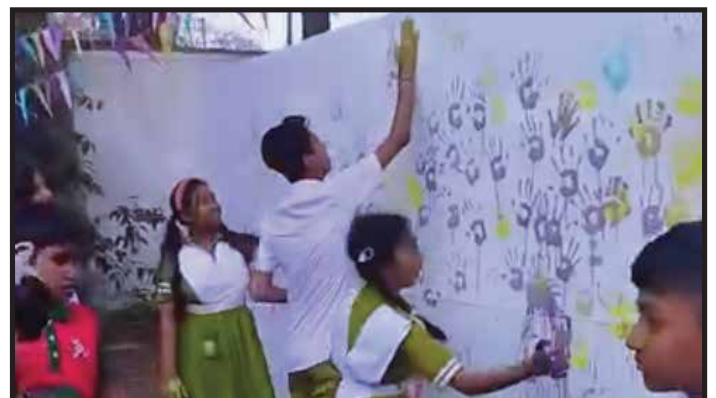
Children are making fun with canvas and color