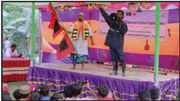
A mock drill and drama on disaster preparedness to raise awareness among community people