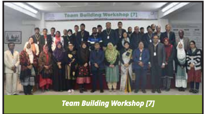
Team Building Workshop [7]