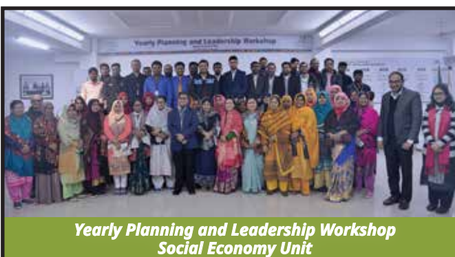
Yearly Planning and Leadership Workshop Social Economy Unit