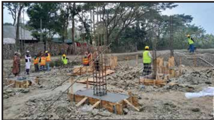
Constructing a multipurpose model and cattle shelter at Komorpur Village