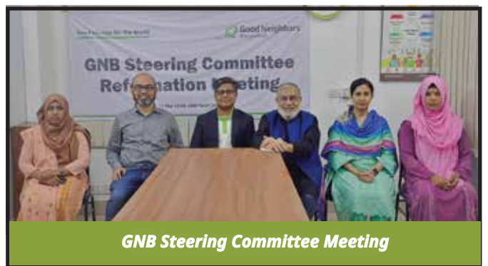
GNB Steering Committee Meeting