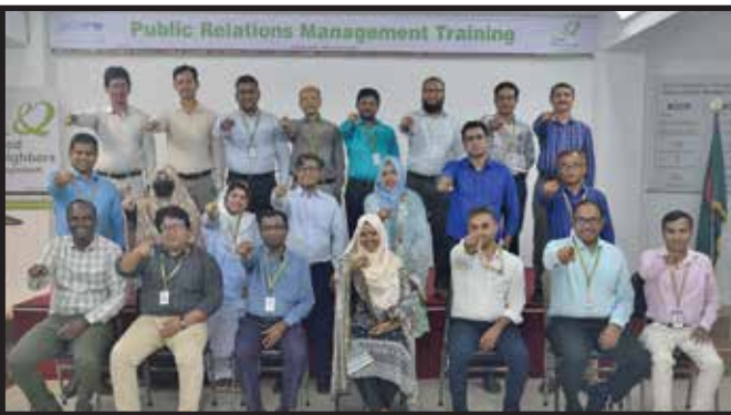
Public Relations Management Training