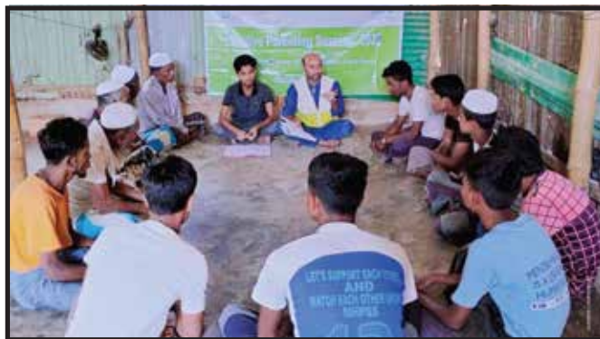
Positive Parenting Session