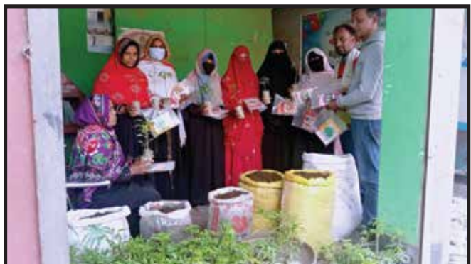
Distributing high-yielding plant seedlings, cultivable at home among the beneficiaries.