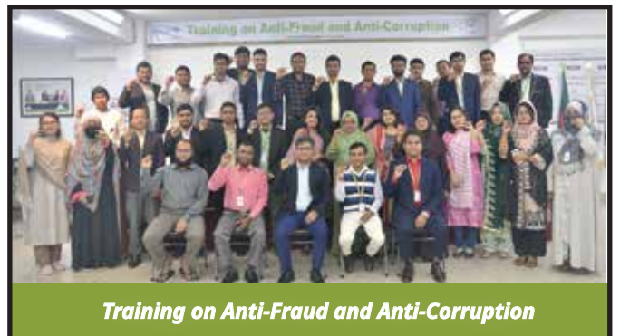
Training on Anti-Fraud and Anti-Corruption