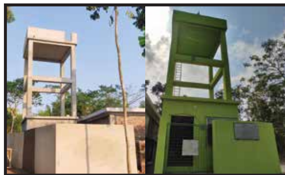
Water Supply System Construction