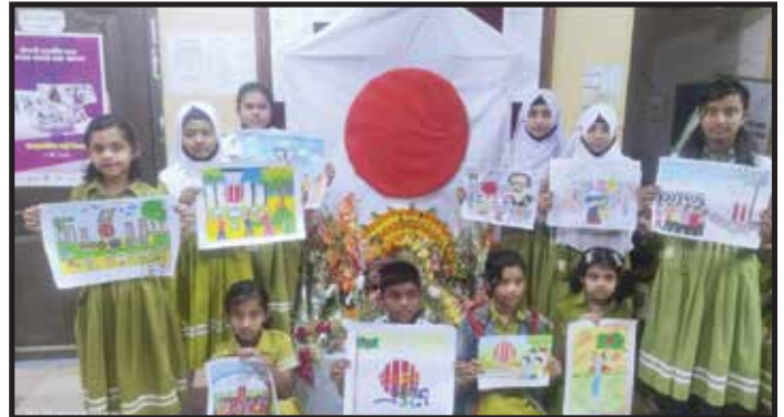
Celebrating International Mother Language Day

Community Partnership is one of the major activities for GNB CDPs, and strengthening CDC is a part of this activity.