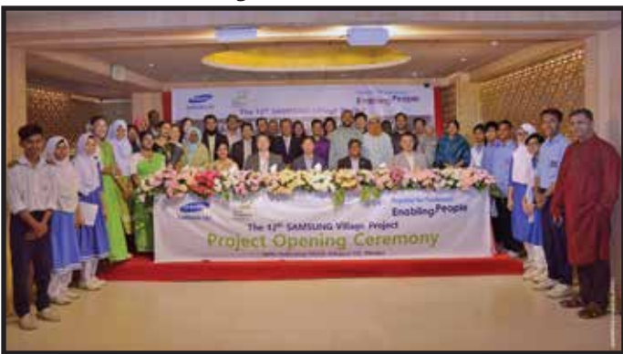
12th Samsung Village Project opening ceremony

To improve the quality of education in 4 schools this project will conduct some special activities among them upgrading the educational facilities (library and science lab), educational materials support, establishing multimedia classrooms, health and hygiene materials distribution, waste management system installation, and reproductive health care for adolescent girls.