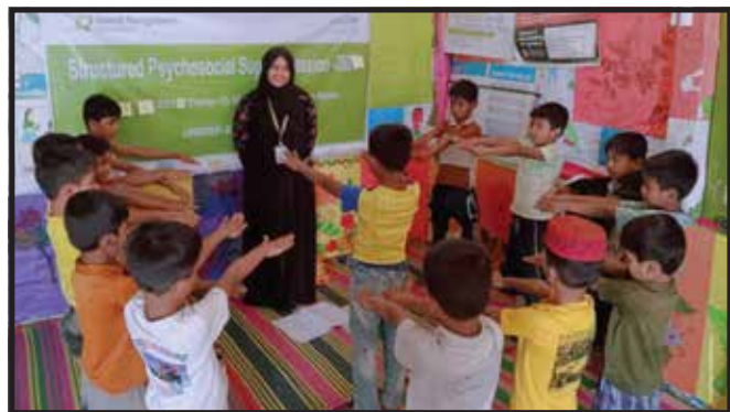
Structured Psychosocial Support Session conducted by a facilitator