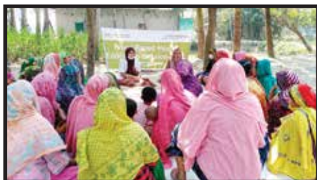
Issue-based health education session conducted by Kalai CDP, Mar/2022