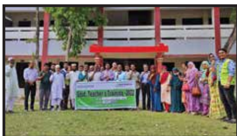
A total of 106 teachers of Govt. Schools received training.