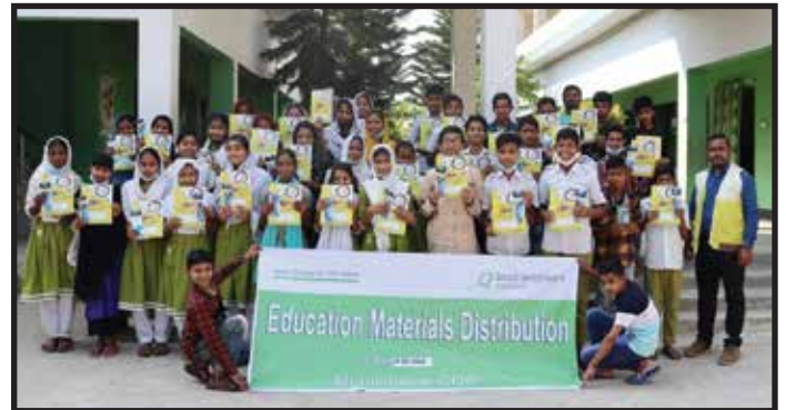
Education Materials distribution by Moulvibazar CDP, Mar/2022