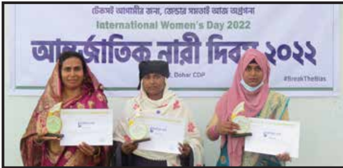
Sahoshika award receivers of Dohar CDP with certificate and crest, Dohar CDP/ Mar 2022