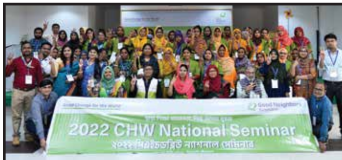
Participants of 2022 CHW National Seminar in a frame, Mar/2022

GNB arranged the "2022 CHW National Seminar" at BRAC Learning Center Sreemongol on 30-31 March 2022.