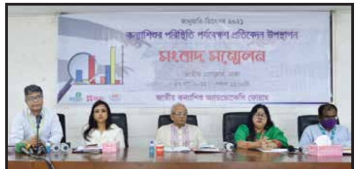
Country Director of GNB participated in the conference as a discussant along with others.

*** Source: From 08 National, 02 Online & 14 Local Newspapers published by: NGCAF