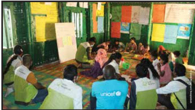
Child protection multi-purpose center operated by GNB RER Project at camp 14 & 15 visited by child protection specialist of UNICEF Cox's Bazar