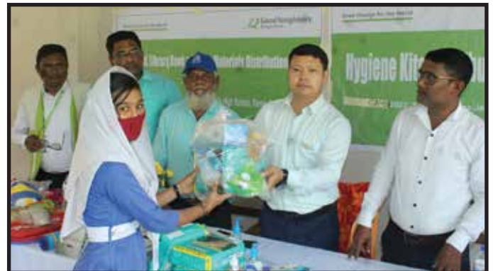
A child receives hygiene kits, First Aid materials, and Sports and Library books from UNO of Ramu Upazila, Cox's Bazar. GNB RER project distributed these materials among 600 girls.