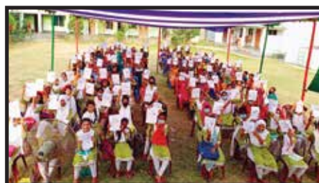
A group of participants of My Dream program, arranged by Shakhipur CDP, Mar/2022