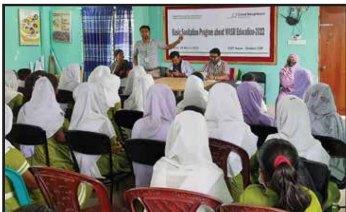
A total of 385 people received awareness education on WASH.