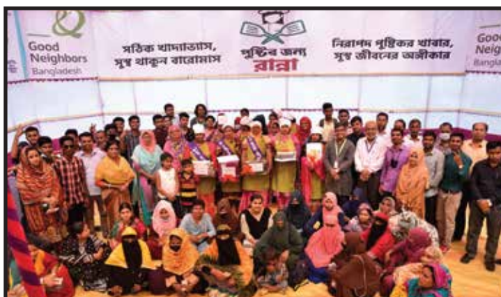
A group photo of contestants, audiences, and judges of the Cooking for Nutrition contest at Sirajganj CDP

Project Goal: To improve nutritional status of children focused on Grade III to V children of 3 schools