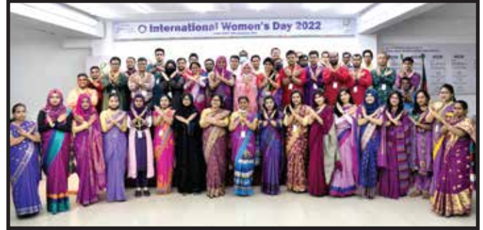
A group photo of GNB Head Office staff with the sign of break the bias in celebrating IWD/ Mar 2022

GNB believes, by CHW's contribution, it is possible to improve maternal and child health nationwide.