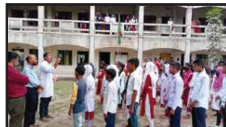
A total of 2,068 people attended community disinfection campaign.