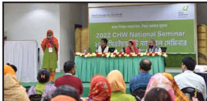
A CHW sharing her experiences in 2022 CHW National Seminar, Mar/2022

CHWs shared their inner feelings and experiences. In this program best CHWs of 4 CDPs (Joypurhat-Kalai, Meherpur, Sirajganj-Nalka, Moulvibazar) are honored and rewarded.