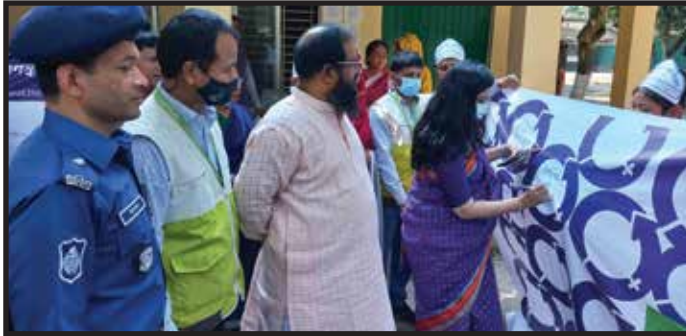
Upazila Chairman and UNO of Bochaganj Upazila, Dinajpur is participating in a mass awareness campaign