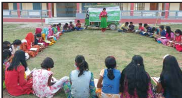
Mobile Library operation by Birganj CDP, Mar/2022