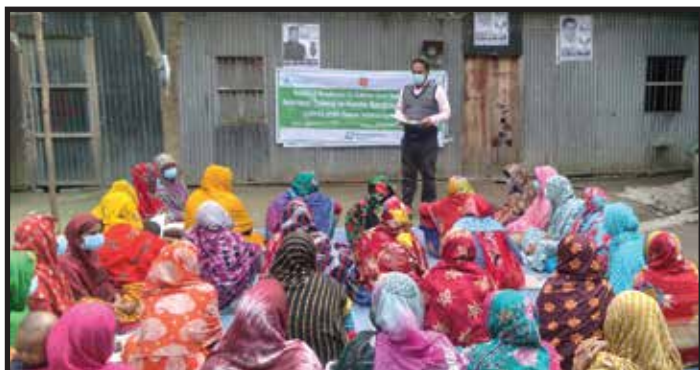
Awareness training on Disaster Management & Preparedness, GNB BRAZH Project

No. of beneficiaries received awareness training on disaster management preparedness