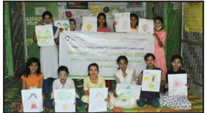
A group of children after art competition arranged by GNB RER Project at camp-14