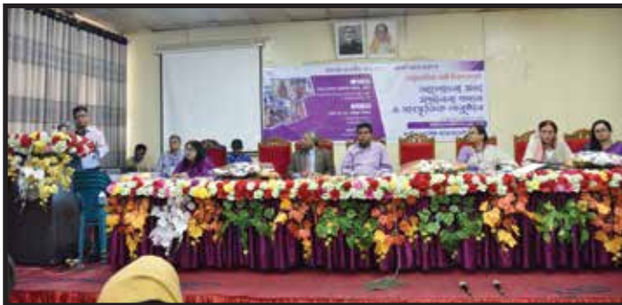
GNB country director (special guest of the event) is delivering greetings speech in IWD-2022 event organized by NGCAF/ Mar 2022