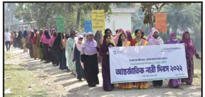
A group of women arrange a rally for celebrating IWD, Ghatail CDP/ Mar 2022