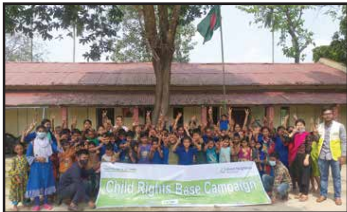
A group photo of the children after Child Rights-based campaign arranged by Moulvibazar CDP, Mar/2022