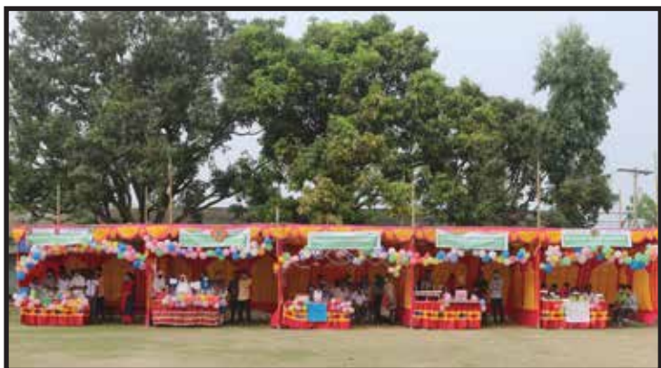
Science Festival arranged by Pirganj CDP to inspire the students in the innovation of new things, Mar/2022

No. of students participated in science festival (arranged in 4 CDPs)