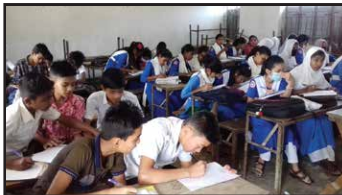
A group of students attended in contest-based education [wordmaster & math maestro], Moulvibazar CDP/Mar 2022