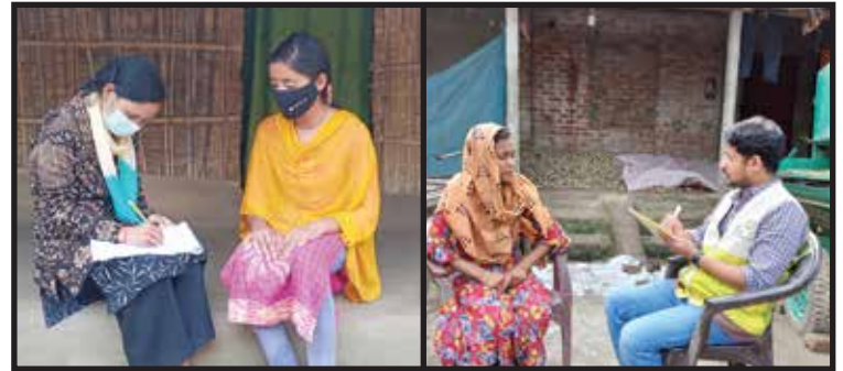
A sponsorship supporter collect data by visiting the sponsored child home, Bochaganj CDP/Mar 2022