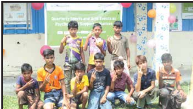
A team is showing the victory sign after quarterly sports event as Psychosocial support initiatives under GNB RER project