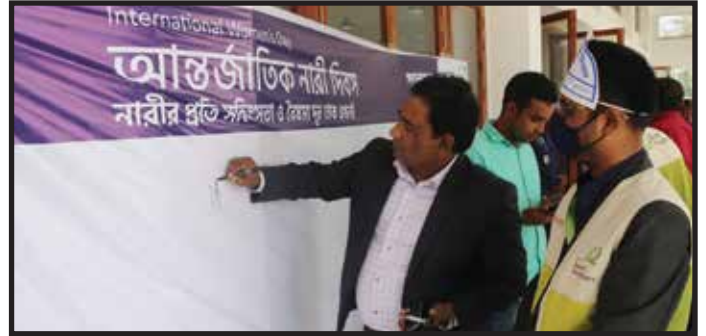
UNO of Pirganj Upazila, Thakurgoan is participating in mass awareness campaign, Pirganj CDP/ Mar 2022