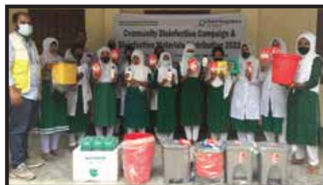
A total of 3,295 people received hygiene materials photo: Kurigram CDP/Mar/2022