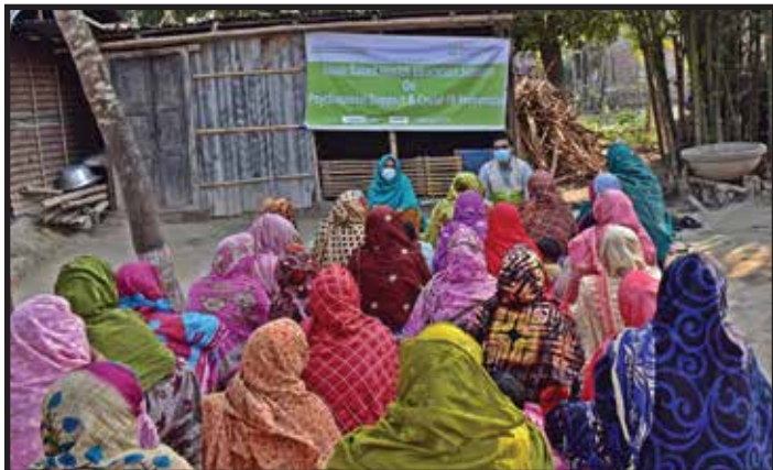
Issue-based health education session on psychosocial support & COVID-19 prevention conducted by health officer of Meherpur CDP/Mar 2022