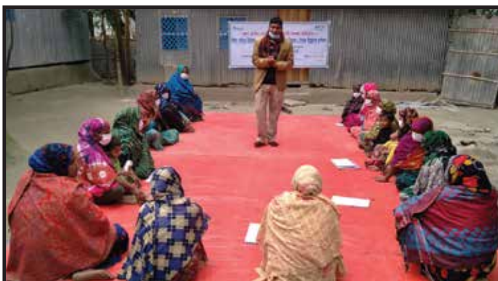
Refresher Income Generation Activities training conducted by a trainer at Jatrapur union, GNB BRAZH Project