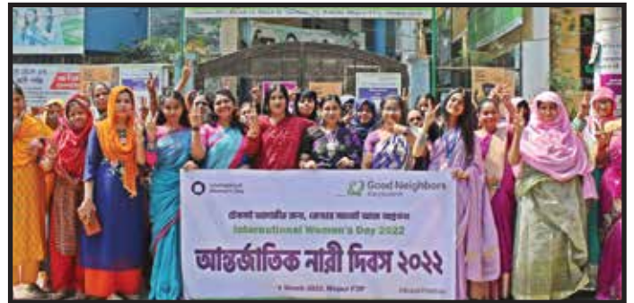
A group of women is participating IWD program, Mirpur FDP/ Mar 2022