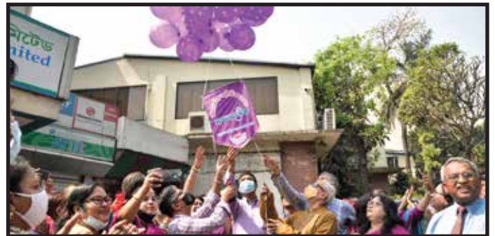
GNB country director along with other guests inaugurate the event of IWD organized by NGCAF/ Mar 2022