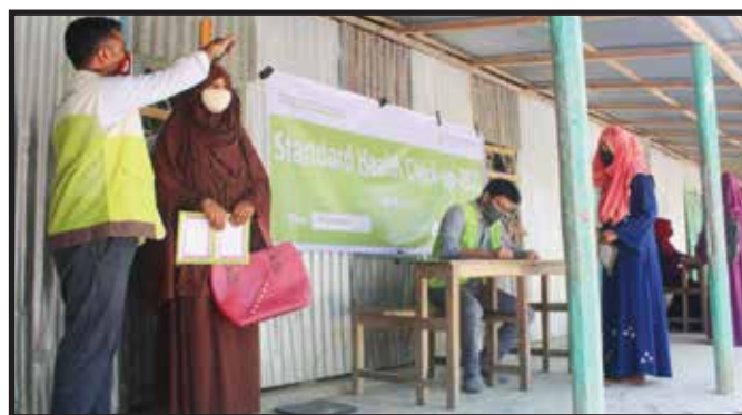
Standard Health Checkup conducted by Medical Officer and Health Officer of Nalka CDP, Mar/2022

No. of children received nutritious food